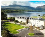
The Lake Hotel Killarney Muckcross Road, Killarney, Ireland