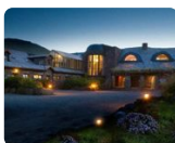
Victoria Hotel Victoria Place, Galway, Ireland